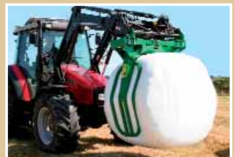
Lockable Arms & Consistent Grip