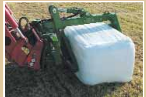
Rear Grip Design

The handler can be easily adjusted to cater for different bale sizes.