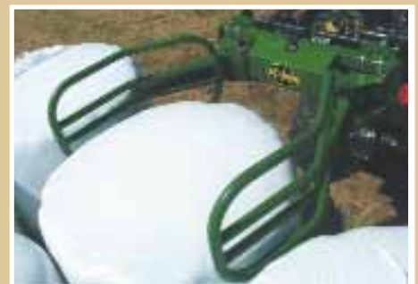
Bale Hand Design