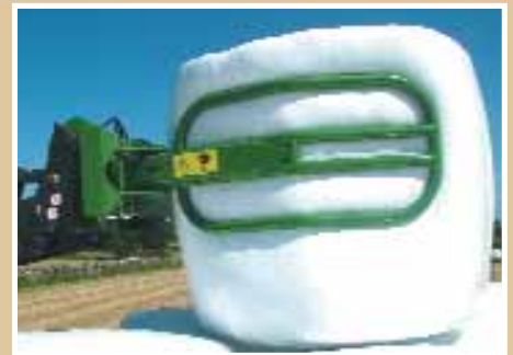
Close Proximity to Loader Carriage

A heavy duty ram complete with check valve ensures a consistent grip as the bale is being transported.