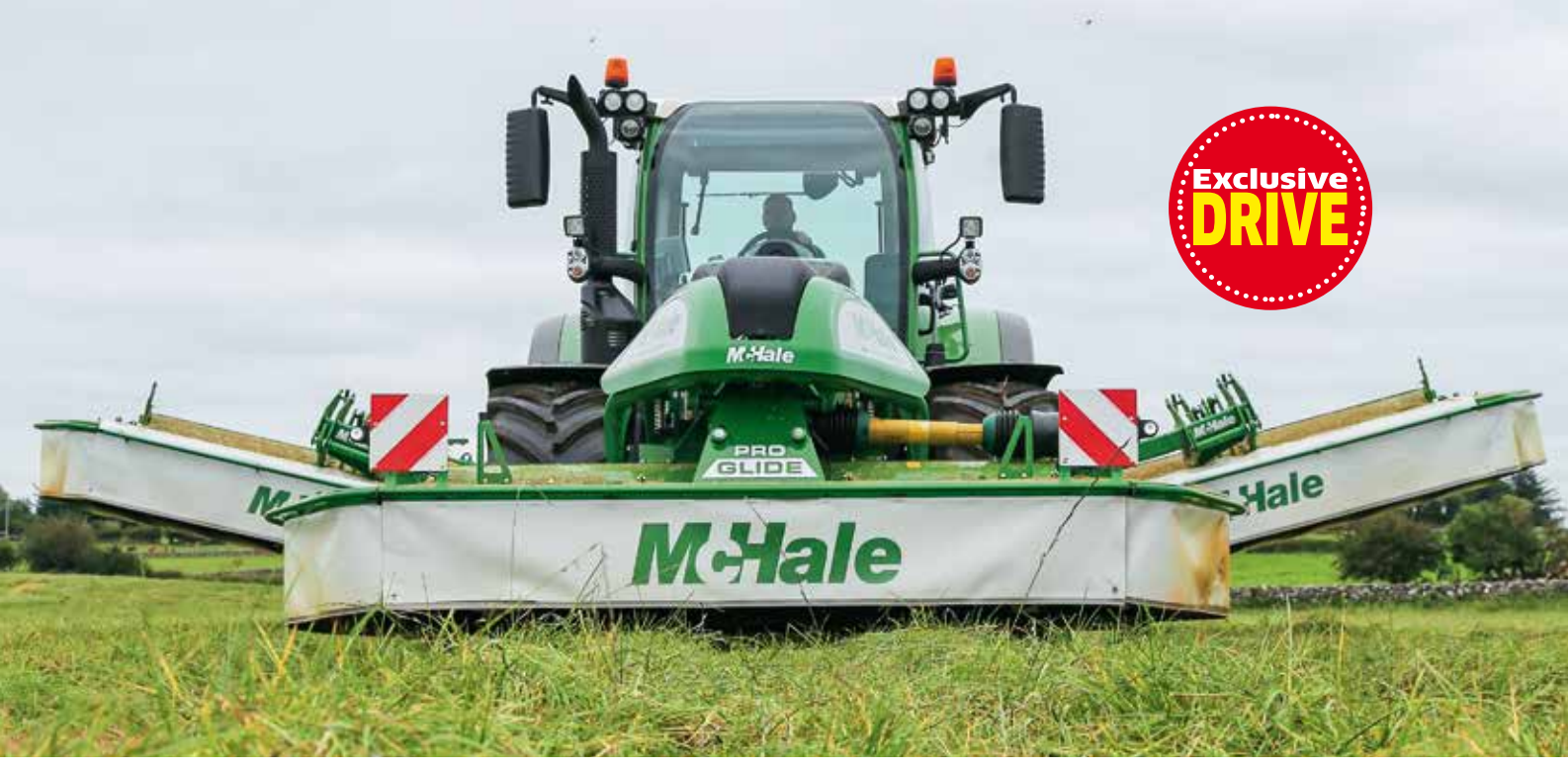
Though McHale only officially launched its triple mower combination at Agritechnica, we managed to get hold of a pre-production unit ahead of the show

McHale Pro Glide triple mower combination: