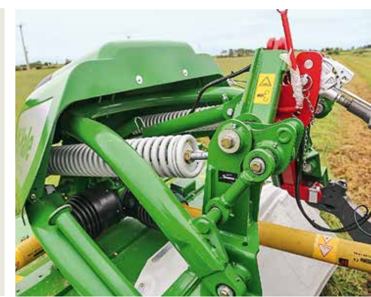
The mechanical double-ended link between the spring and frame maintains a more consistent tension as the mower works through its 500mm

ntering a new machinery segment is no easy feat. After all, there's no point coming along with another 'me too' product if you want to stand out from the established crowd. With this in mind McHale has jumped in at the very top end of the contractor and large-farm grass cutting sector with a triple mower conditioner combination and a major focus on suspension and contour-following ability. Dubbed Pro Glide, McHale's initial line-up will include the R3100, a 3.1m rear-mounted mower, the F3100 front-mounted unit and a B9000 rear butterfly. The reason for going with these working widths is simple: they match the appetite of the company's balers. That said, there are plans to add other mower widths over the coming years.