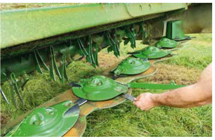
Blade changes are a simple and convenient, pry-open quick change.

bolts and replacing, a job that McHale says should take no more than 10mins. Each of the gears is 25mm thick. Drive is transmitted to the conditioner via a gearbox, with a lever used to select 700 or 1,000rpm.